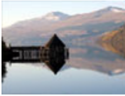
Archaeological Open-Air Museum

Kenmore Aberfeldy, PH15 2HY, Perth and Kinross, Scotland