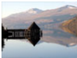
Archaeological Open-Air Museum

Kenmore Aberfeldy, PH15 2HY, Perth and Kinross, Scotland