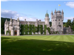
5 Star visitor attraction set amongst the magnificent scenery of Royal Deeside

Historic Buildings and Monuments, Parks Gardens and Woodlands, Visitor Centres and Museums