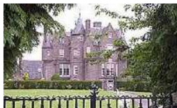
Regimental Museum of the Proud and Illustrious Black Watch Regiment in Perth Scotland

Perth, PH1 5HR, Perth and Kinross, Scotland