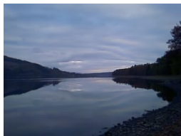
Loch Venachar, The Trossachs

Callander, FK8 3EN, Stirlingshire, Scotland