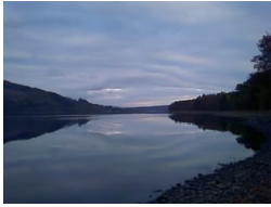
Loch Venachar, The Trossachs

Callander, FK8 3EN, Stirlingshire, Scotland