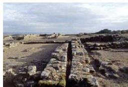
Roman wall snaking across dramatic countryside

Hexham, NE47 6NN, Northumberland, England