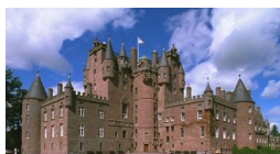
Childhood home of Her Majesty Queen Elisabeth The Queen Mother

Glamis, DD8 1RJ, Angus and Dundee, Scotland