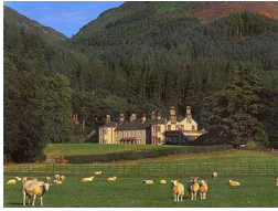
Family home with close links to Tennyson