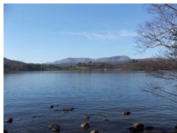
The longest natural lake in England