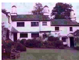
Fine example of Lake District vernacular architecture