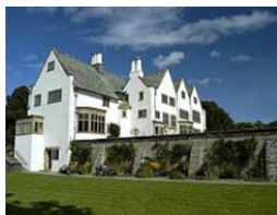
The Arts & Craft House

Historic Buildings and Monuments, Parks Gardens and Woodlands, Visitor Centres and Museums, Childrens Attractions, Cafes Coffee Shops and Tearooms