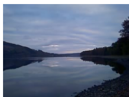
Loch Venachar, The Trossachs

Callander, FK8 3EN, Stirlingshire, Scotland