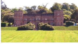
Red Stone Tudor Mansion