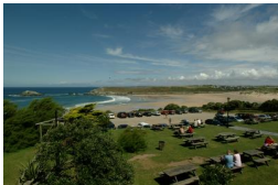
Freehouse Restaurant with stunning views on West Pentir Headland overlooking Crantock Beach, between Newquay and Perranporth