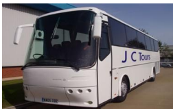
JC Tours is a leading coach and minibus company based in Mid-Cornwall specialising in all types of group travel.

Tours and Trips, Guided Tours and Day Trips