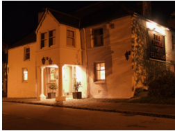
Fine destination pub/restuarant