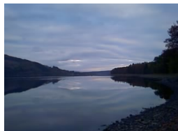
Loch Venachar, The Trossachs

Callander, FK8 3EN, Stirlingshire, Scotland