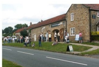
Folk Museum in the North York Moors

Visitor Centres and Museums, Childrens Attractions