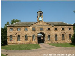
The Pennyman family's intimate 18th-century mansion

Redcar and Cleveland, TS7 9AS, North Yorkshire, England