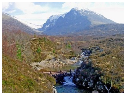
Nevis Range Fort William Mountain Experience

Fort William, PH33 6SW, The Highlands, Scotland