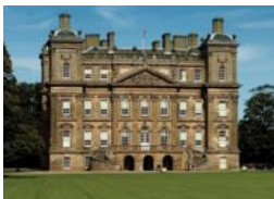
Historic House and Cultural Arts Centre

Art Gallery, Historic Buildings and Monuments, Cafes Coffee Shops and Tearooms, Shops