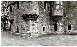
12th Century House

Kirkwall, KW15 1SG, Orkney Islands, Scotland