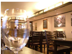
Cafe and Restaurant

Kirkwall, KW15 1DN, Orkney Islands, Scotland