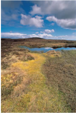
RSPB Bird Reserve

Orkney, KW16 3AG, Orkney Islands, Scotland