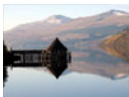
Archaeological Open-Air Museum

Historic Buildings and Monuments, Visitor Centres and Museums