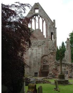
Remarkably complete medieval ruins by the River Tweed

Dryburgh, TD6 0RQ, Scottish Borders, Scotland