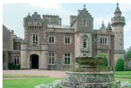
Abbotsford is the house built and lived in by Sir Walter Scott, the 19th century novelist, and author

Melrose, TD6 9BQ, Scottish Borders, Scotland