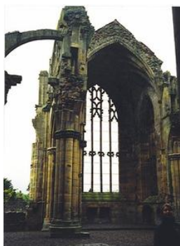
Magnificent ruin on a grand scale with lavishly decorated masonry.

Historic Buildings and Monuments, Visitor Centres and Museums