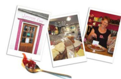
Gallery and Coffee Shop in the Scottish Borders. Very welcoming, delicious home-made cakes and light lunches. Gorgeous gifts and paintings by very talented local artists.

Art Gallery, Cafes Coffee Shops and Tearooms, Shops