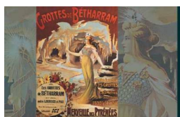
Natural caves with staligmities and lake and train

Historic Buildings and Monuments, Tours and Trips, Childrens Attractions