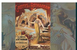
Natural caves with staligmites and lake and train

Historic Buildings and Monuments, Tours and Trips, Childrens Attractions