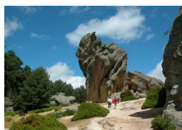
We offer cultural walking holidays in Soria, Northern Spain