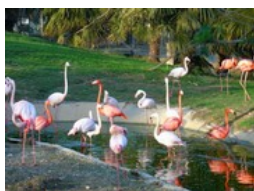
Tigers, snow panthers, maned wolves, parrots, kangaroos, or even marmosets ... there are over 100 species and 150 animals waiting to meet you.

Visitor Centres and Museums, Childrens Attractions, Zoos Farms and Wildlife Parks