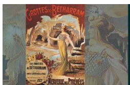
Natural caves with staligmites and lake and train

Historic Buildings and Monuments, Tours and Trips, Childrens Attractions