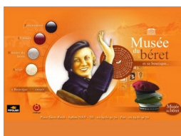
Everything you wanted to know about Berets!

Nay, 64800, Pyrenees-Atlantiques, France