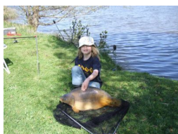
Carp and coarse fishing on three scenic lakes. Catch carp in excess of 40 lbs