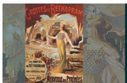
Natural caves with staligmites and lake and train

Historic Buildings and Monuments, Tours and Trips, Childrens Attractions