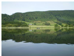
Fishing on the Lake Of Menteith

Port Of Menteith, FK8 3RA, Stirlingshire, Scotland