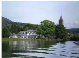
Hotel and waterfront restaurant with fantastic views of the Lake Of Menteith.

Port Of Menteith, FK8 3RA, Stirlingshire, Scotland